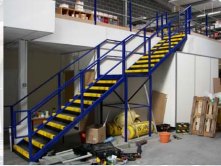
NEW Part K staircase